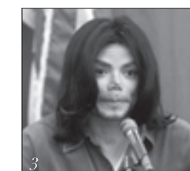
3. The latest chapter in Michael Jackson's escalating weirdness comes as he is charged with child molestation.