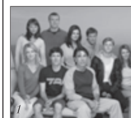
1. The OC, a primetime drama starring unknown and attractive actors, becomes the year's most popular new show.