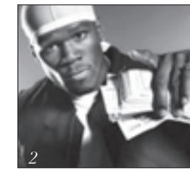
2. 50 Cent releases the hit "In Da Club," and his album "Get Rich or Die Tryin'" goes to the top of the charts.