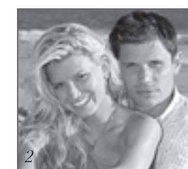
2. "Newlyweds," a reality show with married couple Jessica Simpson and Nick Lachey, rejuvenates Simpson's career by showcasing her lack of intellect (chicken or tuna?).