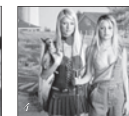
4. "The Simple Life," with socialites Paris Hilton and Nicole Richie, is a runaway hit in the summer.