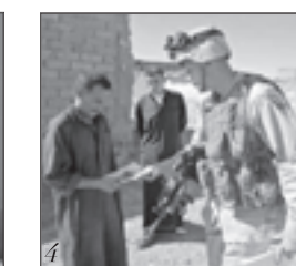
4. The war in Iraq dominates the news, especially when dictator Saddam Hussein is captured and evidence of mistreatment of prisoners comes to light.