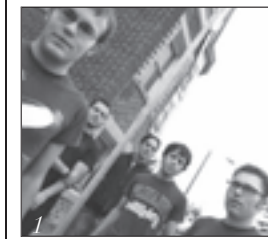
1. The Getup Kids, a local Kansas City band, enjoy more popularity as interest in pop-punk bands surges.