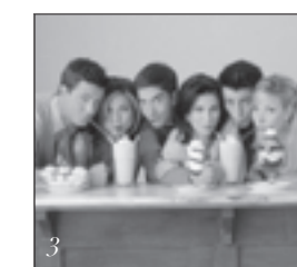
3. Friends ends to much fanfare after 10 years on the air.