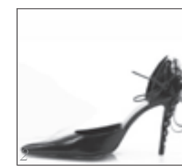
2. Stilettos cause foot pain as they return to the fashion front, partly due to HBO's "Sex and the City."