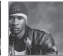
4. Usher makes a comeback with his song "Yeah," and his album "Confessions."