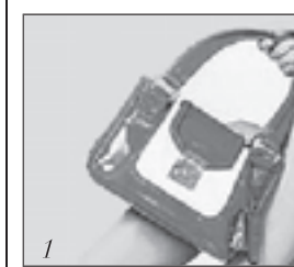
1. Status bags, such as those from Louis Vuitton and Coach, become popular among teens.