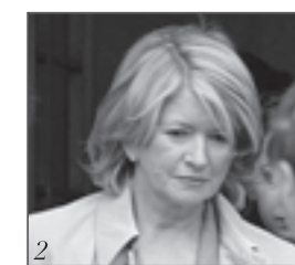
2. Martha Stewart's wholesome and all-American image is shattered by accusations of insider trading.