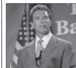
1. Arnold Schwarzenegger becomes governor of California in the recall vote against Gray Davis.