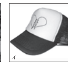
4. Trucker hats are made popular by Ashton Kutcher and dirty truck drivers nationwide.